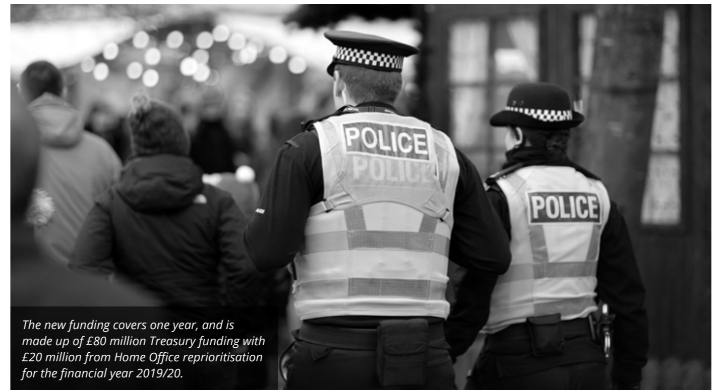
The new funding covers one year, and is made up of £80 million Treasury funding with £20 million from Home Office reprioritisation for the financial year 2019/20.

This is on top of the £970 million of additional money that policing is already due to receive from April 2019, including additional funding that the Chancellor announced at last year's Budget. Police and crime commissioners have already committed to the recruitment and training of nearly 3,000 extra police officers. ◀